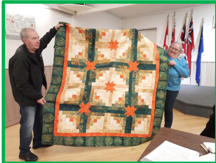
Beautiful, queen-sized quilt, made by the 5-Star Quilt Guild, with members from Teeswater, Mildmay, Lucknow and Wingham and Ripley!

Tickets on this beautiful quilt will be on sale soon! We will be sure to put a notification on Facebook as soon as the tickets are available.